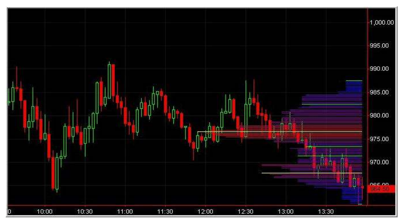
The same TAS Swing Map™ on 5-minute S&P futures after a new swing is detected

Notice how the peak volume distribution area (denoted by the yellow horizontal line) encompasses trading data from ~10:45 to 13:30. When a new swing is detected by the algorithm, the entire profile shifts to the right to reveal new information about the market.