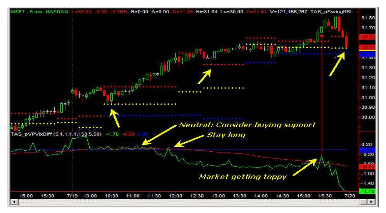
TAS VIX Differential<sup>™</sup> on 5-minute equity (MSFT)