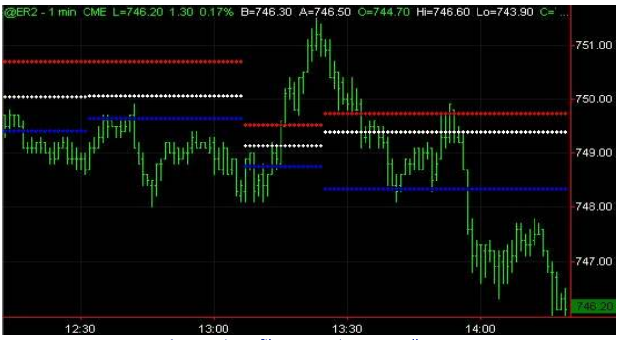
TAS Dynamic Profile<sup>™</sup> on 1-minute Russell Futures

This indicator shows several small versions of the TAS Market Map <sup>™</sup> at various points along a price line. New maps are created when new swings are forecast in the market. Maps are calculated based on the price action from the previous map.