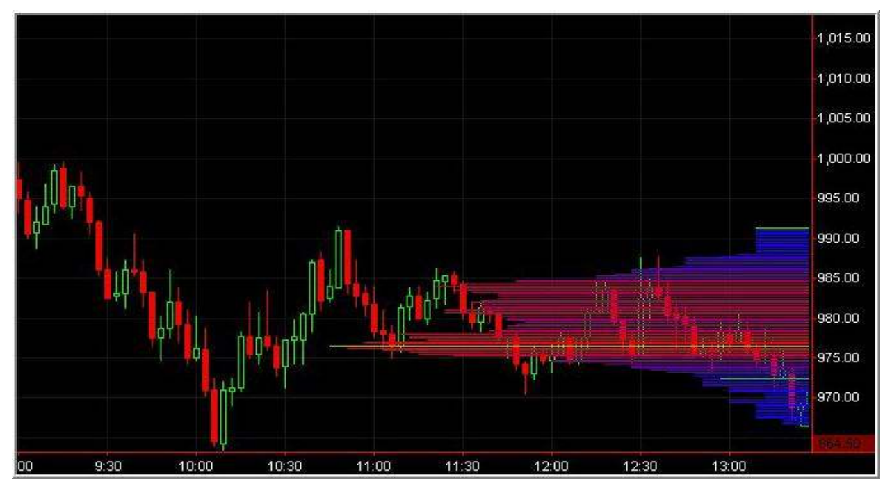
TAS Swing Map^{m} on 5-minute S&P futures before a new swing is detected

The following chart shows an example of the TAS Swing Map <sup>™</sup> indicator where the parameters SwingAtBase is set to 0 and SwingAtPeaks is set to 3.