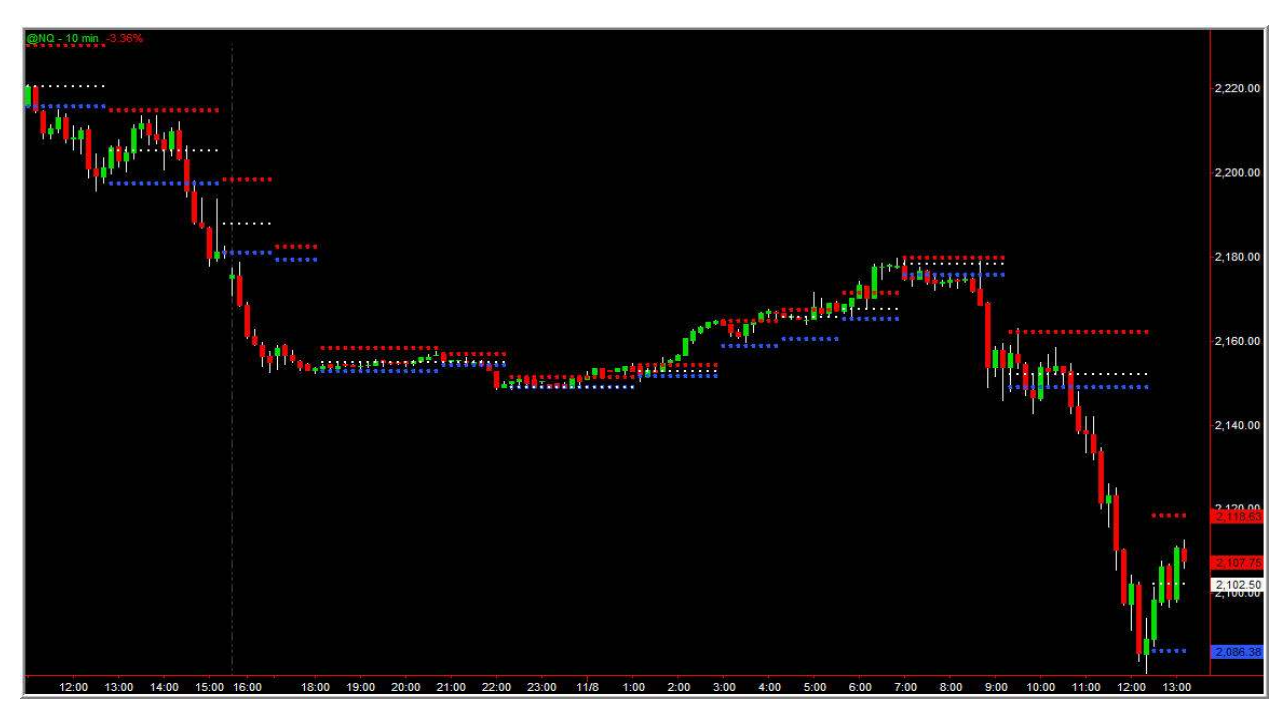
TAS Dynamic Profile<sup>™</sup> on 10-minute NASDAQ Futures

Also notice how the height of the Boxes<sup>TM</sup> varies from each set of Boxes<sup>TM</sup> to the next. As a guideline, the tighter the range, the lower the volatility. The wider the range, the higher the volatility.