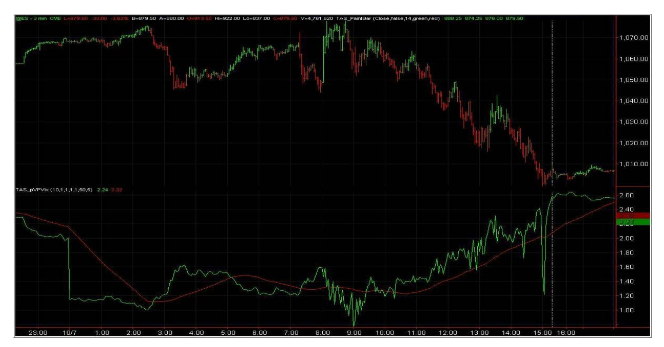
TAS VIX™ on 3-minute S&P Futures