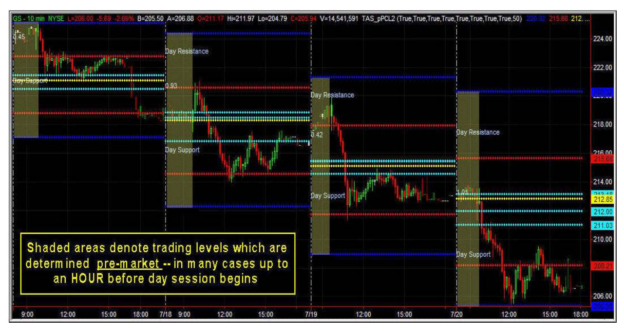
Four day's worth of PCLs displayed on 10-min. chart of Goldman Sachs (GS)

TAS PCLs <sup>™</sup> simplify the immediate levels of volume analysis, volume aggregation and multipletime frame confluence and display accurate targets of demand and supply levels for the day's trading.