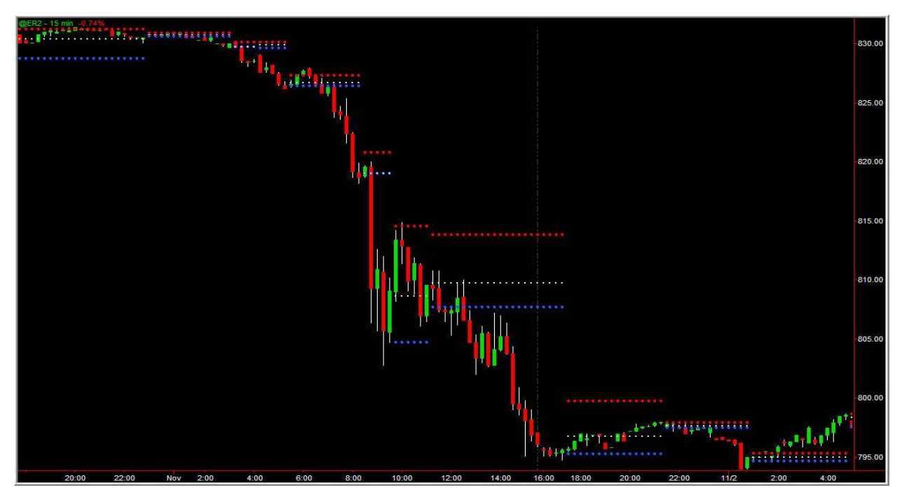
TAS Dynamic Profile™ on 15-minute Russell Futures

Another concept to notice is that when price moves away from a set of Boxes <sup>™</sup>, the movement speeds up directionally. This is the "tipping point" in the market where price moves from slow and horizontal—to fast and directional.