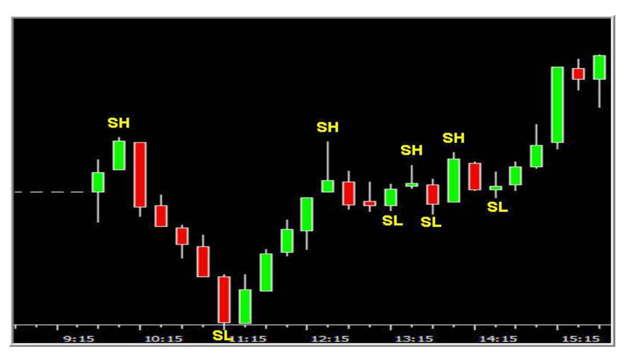
Example of candlestick chart with swing highs and swing lows marked

The traditional technical definition of a [price] swing high is a price formation where a peak high in price is preceded <u>and</u> followed by a lower high on both sides of a peak price high. The traditional technical definition of a [price] swing low is a price formation where a peak low in price is preceded <u>and</u> followed by a higher low on both sides of a peak price low. The following chart illustrates some swing highs (SH) and swing lows (SL):