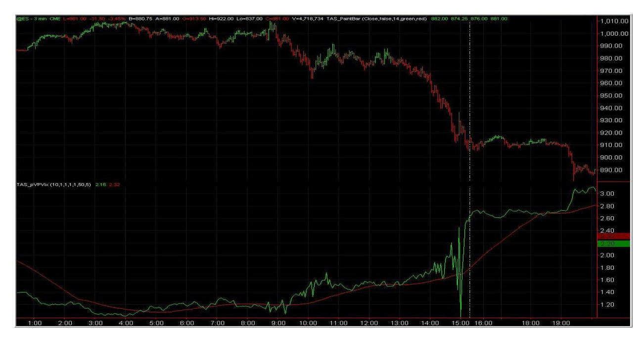
TAS VIX™ on 3-minute S&P Futures