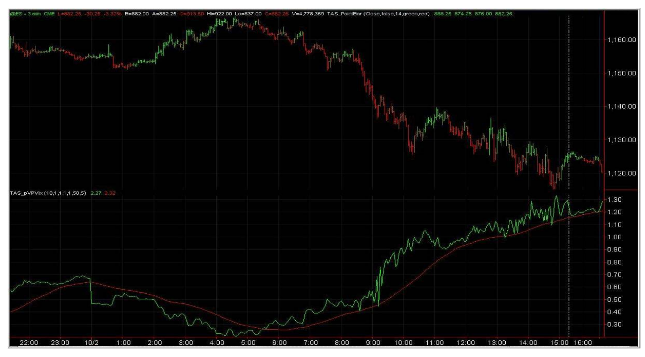
TAS VIX™ on 3-minute S&P Futures

Unlike the CBOE VIX, our proprietary volatility indicator, the TAS VIX <sup>™</sup>, is portable to all markets and gives us the true measure of buying and selling pressures in the marketplace. The TAS VIX <sup>™</sup> is displayed in the lower panel of the following charts.