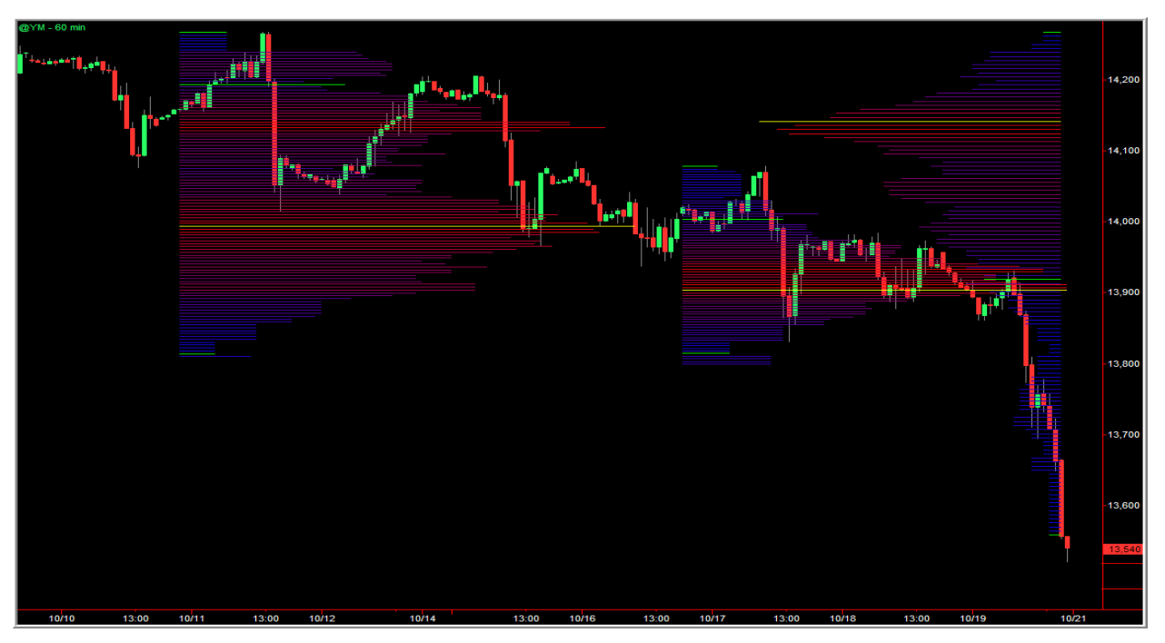
Multiple TAS Market Maps<sup>™</sup> on 60-minute Dow Futures

These multiple maps give traders key insights into areas where the market is likely to move sideways versus where the market is likely to trend. The maps are also very precise in indicating where the market is likely to move slowly and develop horizontally though time—versus where the market is likely to move rapidly through price. Multiple maps make this possible by displaying a confluence of areas of institutional interest.