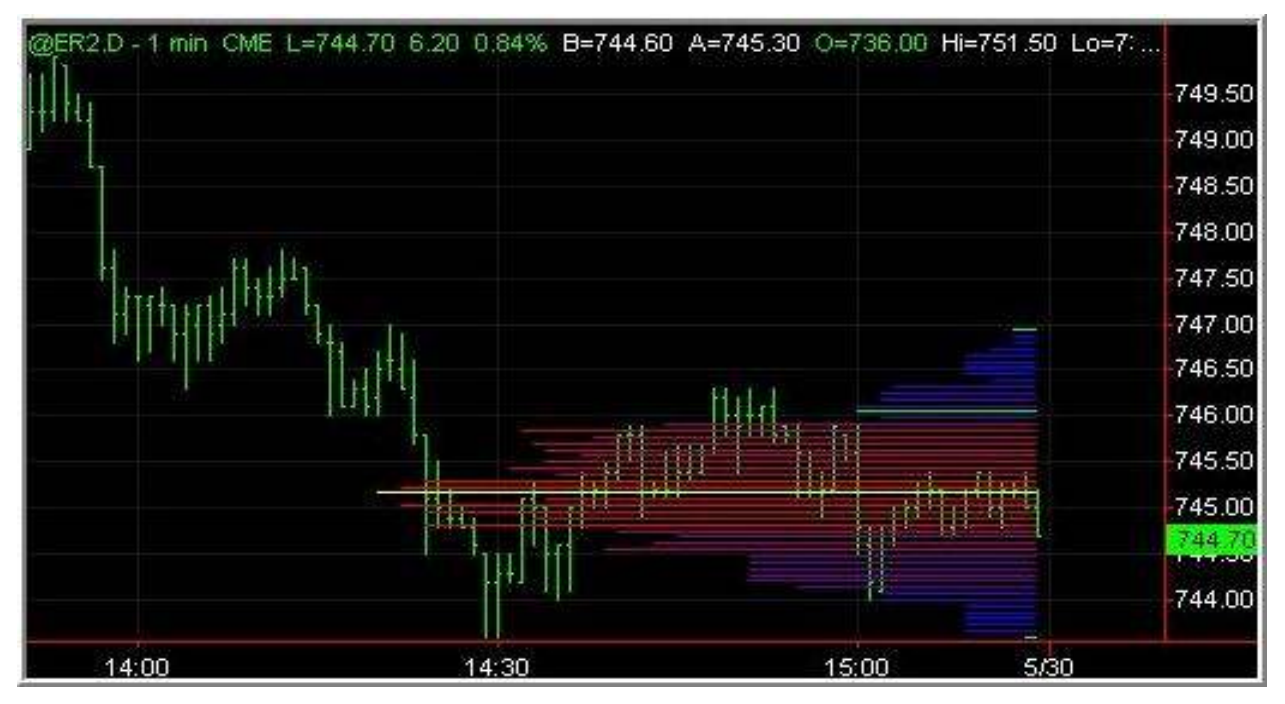
TAS Market Map™ on 1-minute Russell Futures

Red (wider horizontally) areas in the maps reflect a relatively higher volume of contracts (or shares) traded, while blue (narrower) areas reflect relatively lower-volume price moves.